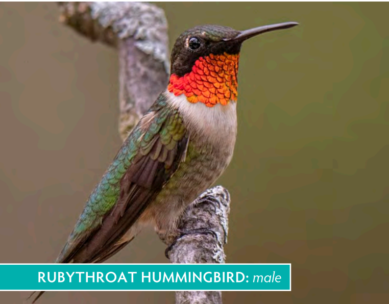
RUBYTHROAT HUMMINGBIRD: male

The Black-Chinned, Rubythroat, and the less commonly seen Rufous, are the three most common species of hummingbirds observed in our region. In order to keep these guests healthy and happy while they are visiting, there are a few key things you should know. Hummingbirds are attracted to red and orange tubular flowers. Insects do not see the color red so competition for available nectar is reduced by simply planting "reds". Flame acanthus, Texas Lantana, Turks