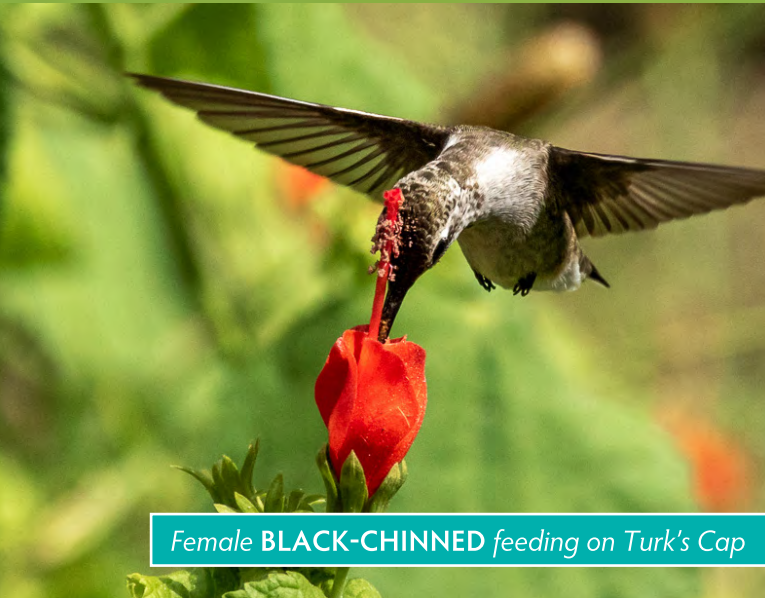
Female BLACK-CHINNED feeding on Turk's Cap

insects and are important feeding grounds for hummers. These same bushes and shrubs may also serve as hummingbird nesting sites.