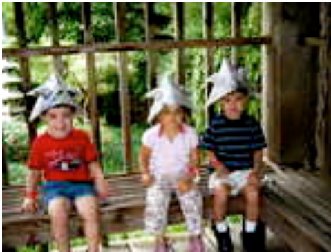
At the Japanese Garden's Fall Festival pictured from left to right are: